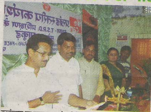
कार्यशाला का उद्घाटन करते अतिथि